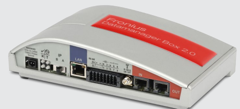
/ Fronius Datamanager Box 2.0